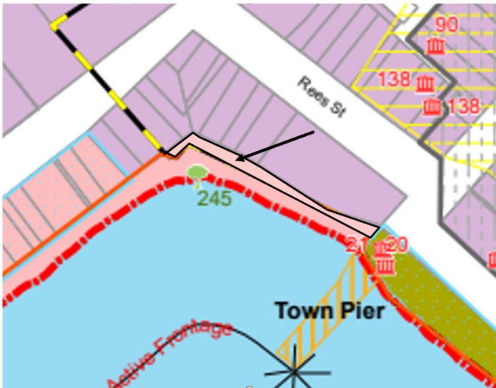
Figure 3 – QTTC Zone to be deleted from the area shown as pink with a bold black outline and replace with Civic Space Zone, as shown.