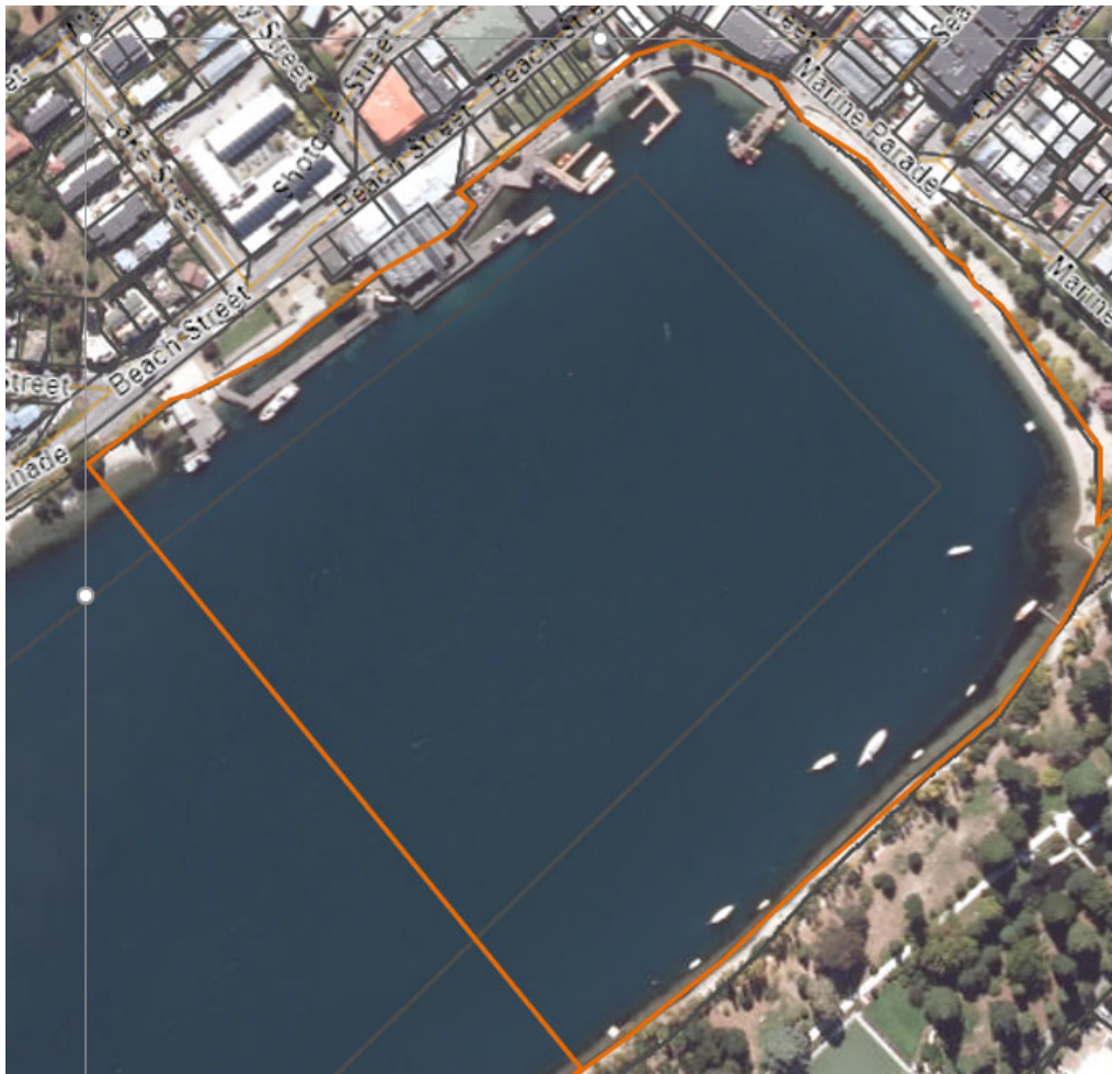
Figure 2 – Amended QTWSZ boundary, as proposed by this Variation