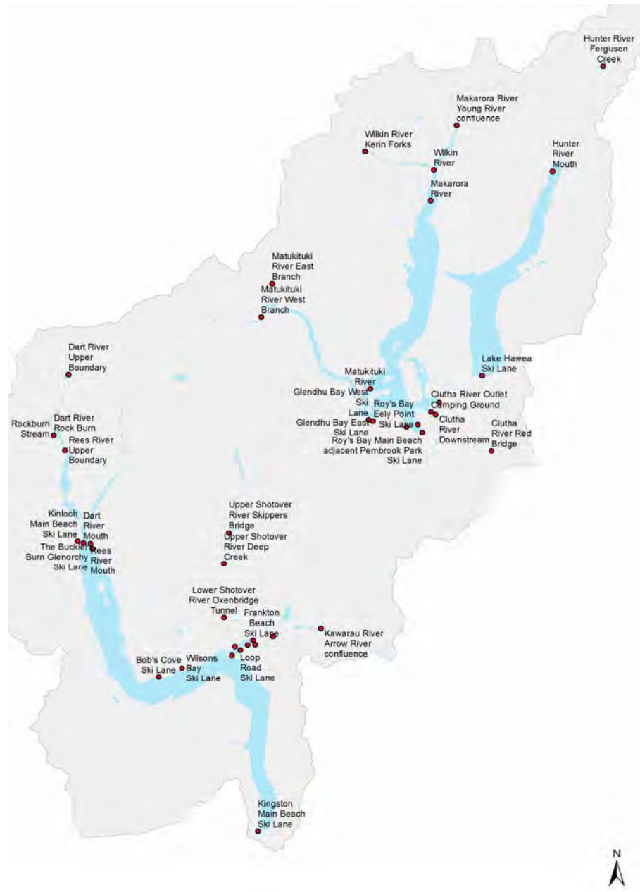
Map 1 – Queenstown Lakes District Overview