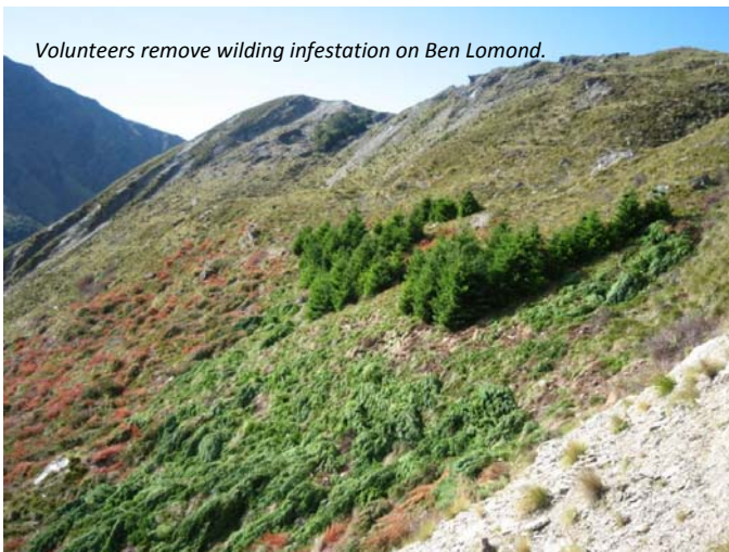
Volunteers remove wilding infestation on Ben Lomond.

Mount Dewar Station: larch outliers developing into closed canopy