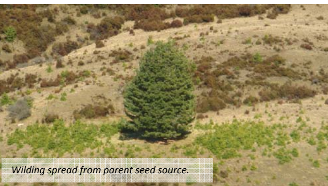
Wilding spread from parent seed source.

Wilding control work has been successfully carried out in the Wakatipu for many years. A factor which makes wilding spread manageable is that conifers are very obvious to spot on the landscape well before coning begins (age of seed production is between 6 and 30 years - 12 years on average - depending on the species). Wilding spread is predictable, though there are many variables.